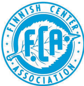
Finnish Center 50th Anniversary 2016