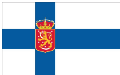
Finland 100th Independence 2017