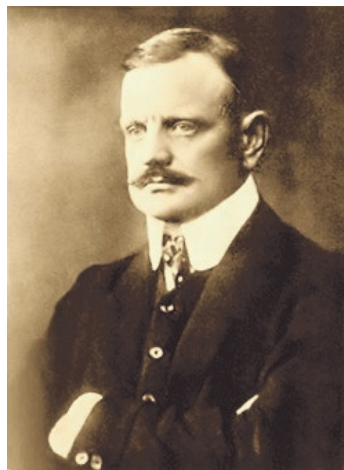
Sibelius 150th Birthday 2015

35200 W. Eight Mile Road Farmington Hills, MI 48335-5108 Tel: (248) 478-6939 Fax: (248) 478-5671 finnishcenter@gmail.com www.finnishcenter.org